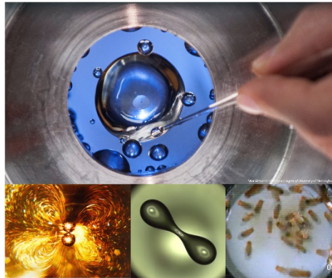
FIG. 1. Top) Droplets of water levitating in a superconducting magnet at the University of Nottingham. Bottom) From left to right: magnetically-levitated bismuth granules shaken in water; a rapidly spinning levitated water droplet undergoing fission; levitated fruit flies.

The equilibrium shape of the drops changes as we spin them up: they deform from spherical to peanut-shaped and eventually break apart. I will discuss recent experiments showing the effect of electric charge on the equilibrium shapes and fission modes of the spinning droplet [1] (FIG.2).